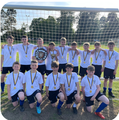
Thomas Adams School U13 team

This year, Thomas Adams School achieved outstanding success in boys' football, with six teams reaching the Shropshire Schools County Finals - more than any other school in the county. Our Year 7, 8, 9 and 11 teams demonstrated exceptional teamwork, commitment and sporting talent throughout the season. We are incredibly proud of our students and staff for this fantastic accomplishment and look forward to building on this momentum next year.